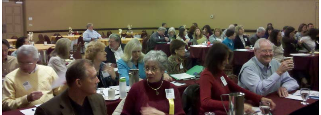
72 attendees enjoyed the wonderful Speakers School in November.

Membership in the NSA/Carolinas is possible once you become a Professional Member of The National Speakers Association or an NSA Academy Member. Please go to www.nsaspeaker.org and click on the Membership Link for further information. Non-members can attend our meetings at the guest rate. If you have any chapter membership questions, please contact the NSA/C office at nsacarolinas@aol.com